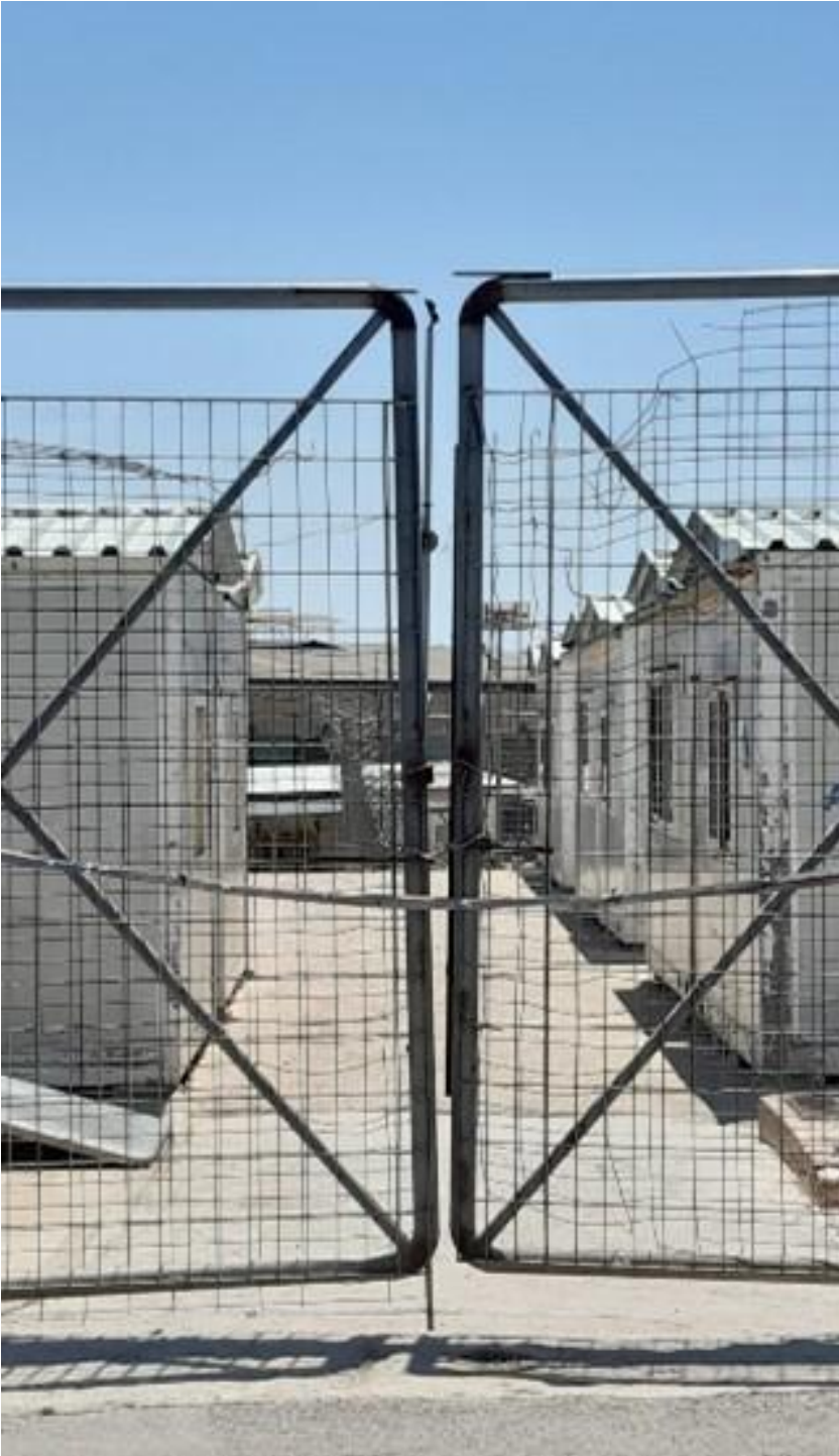
Entrance gates and fences at the RIC in Chios

All photos were taken in Greece in June 2022