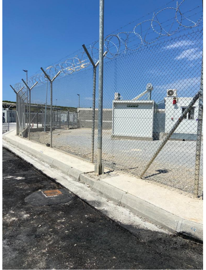
Entrance gates and fences at the CCAC in Samos

All photos were taken in Greece in June 2022