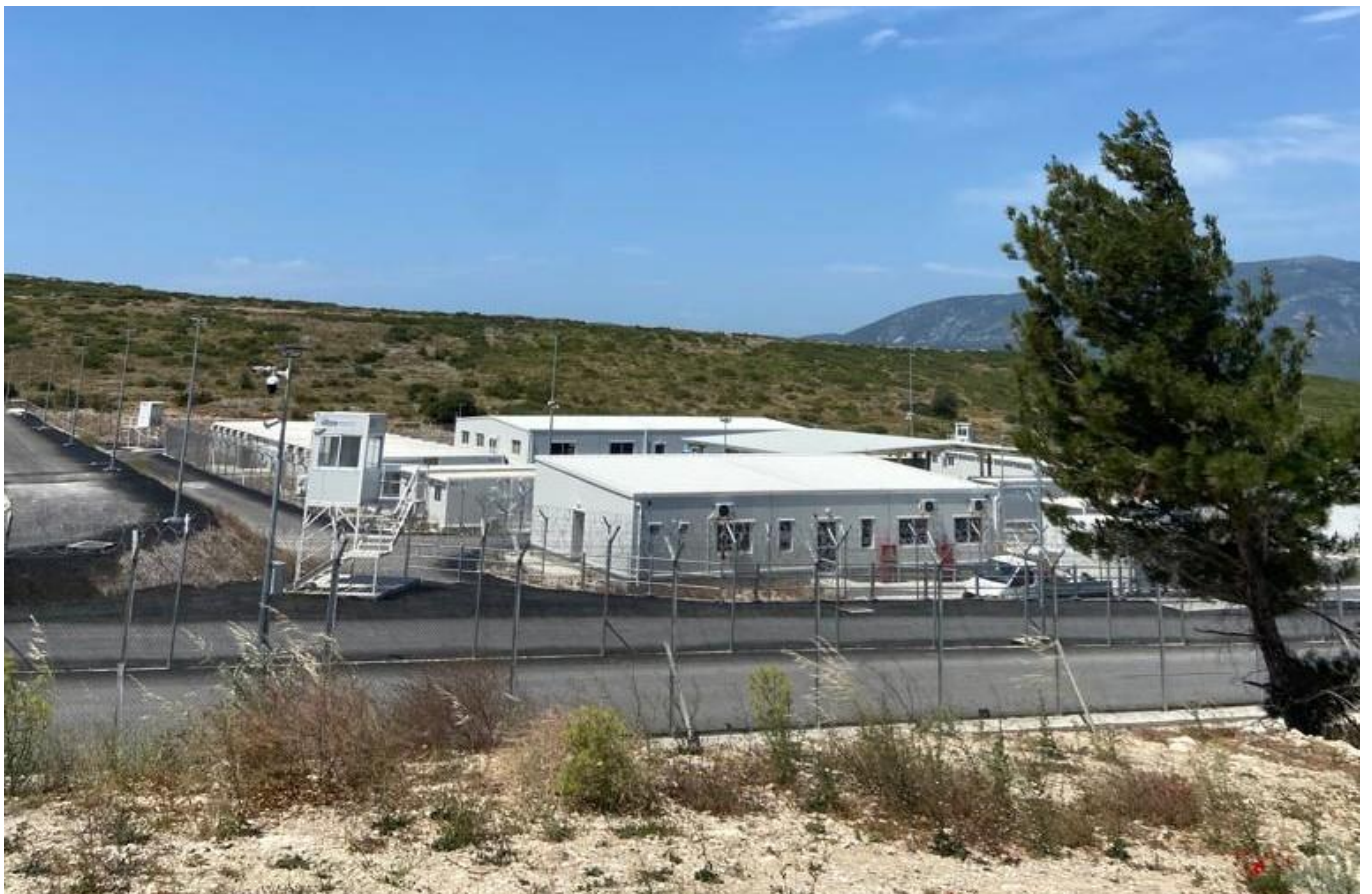
External view of the CCAC in Samos

All photos were taken in Greece in June 2022